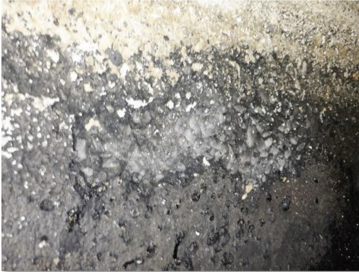
Photo 3-18. Wall of JB3 with large aggregate exposed and grease build-up.