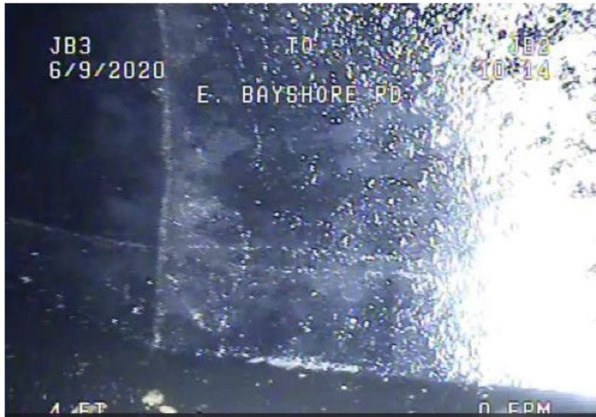
Photo 3-5. Mortar lined steel corner of 22.5-degree horizontal elbow in good condition.