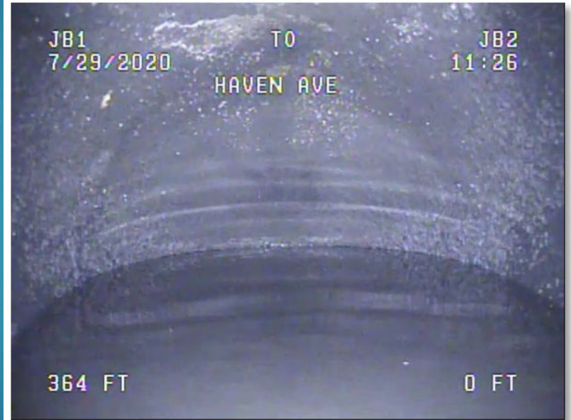
Photo 3-8. Mitered cement mortar lined steel, vertical 90-degree elbow in good condition