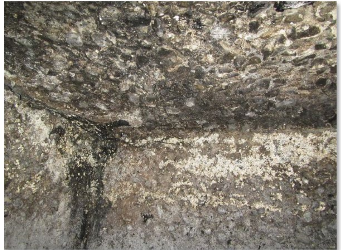
Photo 3-20. Wall and ceiling of JB4 with large aggregate exposed.